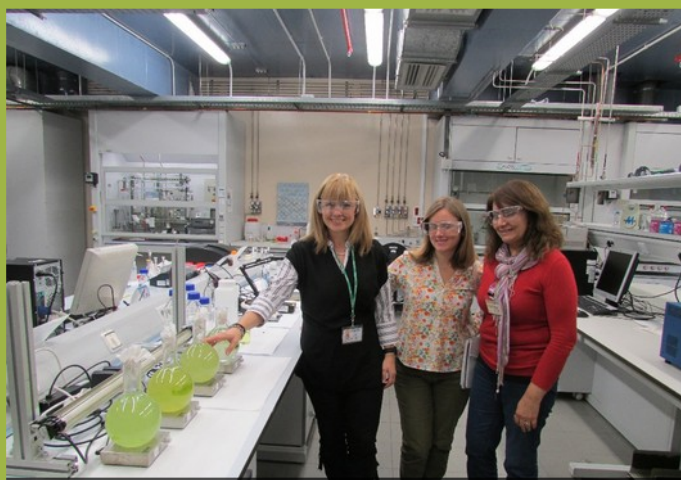
Algae and CO 2 for wastewater treatment at MATGAS